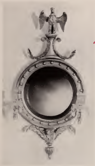
225. 132--LUSTRED CARVED AND GILDED CONVEX MIRROR American, XVIII Century

Reed-molded circular frame with ball drops and with black fillet; husk pendant; surmounted by eagle standing on incurved leaf. Enriched pedestal, two arms scrolled to cut glass sockets and lusted cup bôches.